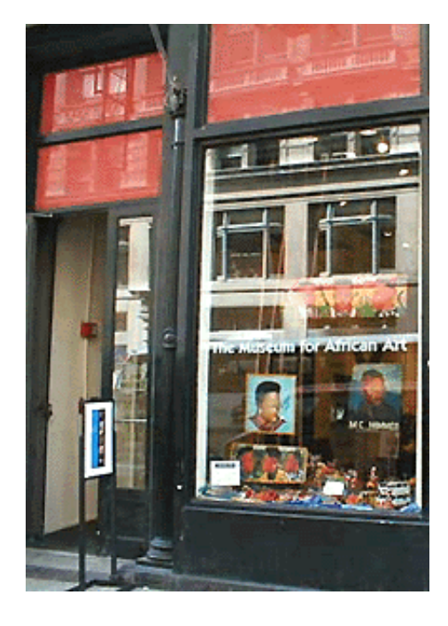
Museum for African Art on Broadway (image: NY.com)

organization in SoHo, visit the SoHo Arts Network website.